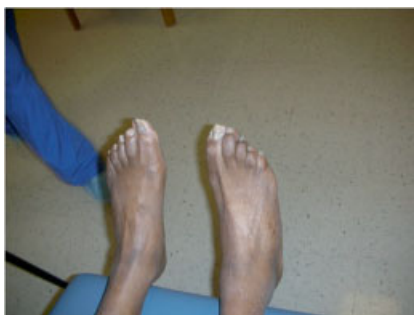
FIGURE 2. Patient B's feet. With minimally invasive measures, limbs can be saved from amputation.

Without proper screening, patient B would have continued to have decreased mobility and an increased risk of develop-