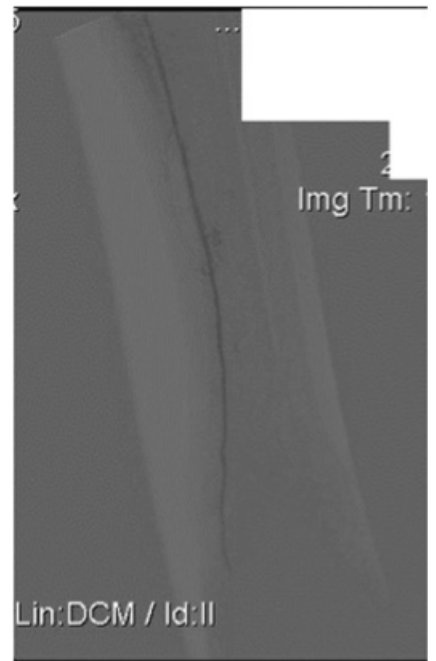
FIGURE 4. Patient B's diseased posterior tibial artery after treatment. Prior to angioplasty, there was no visible blood flow to the patient's foot. Without screening, this patient's limb would have been at risk for amputation.

With screening, patient B now has clear bilateral arterial run-off. He can return to a more active lifestyle with a decreased risk for CLI and amputation (Figure 4).