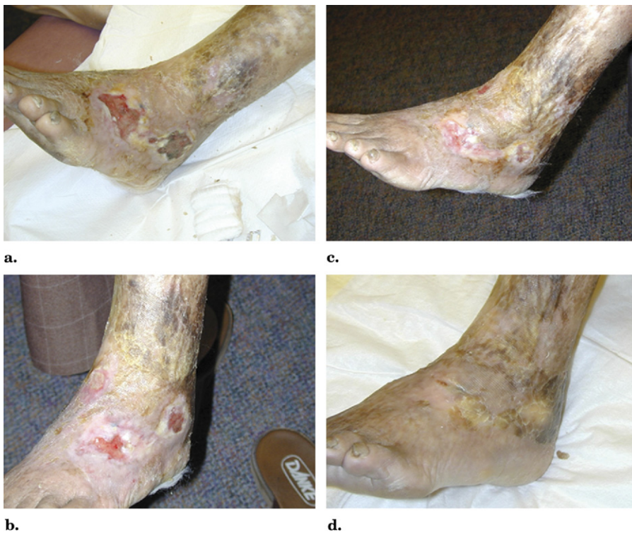
Figure 1. Photographs show healing of venous ulcer by 3 months. Images obtained before EVLT (a), 1 week after EVLT (b), 1 month after EVLT (c), and 3 months after EVLT (d).